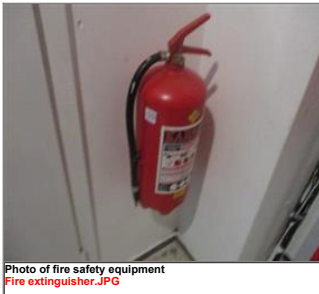
Photo of fire safety equipment Fire extinguisher.JPG