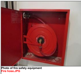
Photo of fire safety equipment Fire hose.JPG