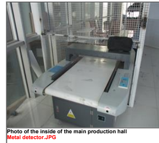
Photo of the inside of the main production hall Metal detector.JPG