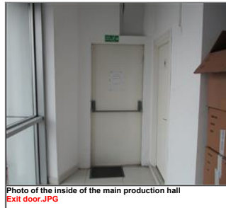
Photo of the inside of the main production hall Exit door.JPG