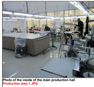
Photo of the inside of the main production hall Production area 1.JPG