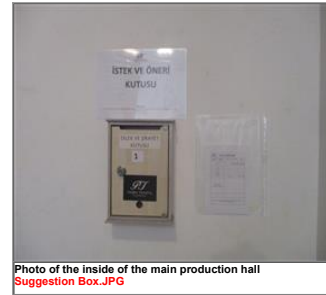
Photo of the inside of the main production hall Suggestion Box.JPG