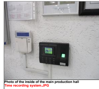
Photo of the inside of the main production hall Time recording system.JPG