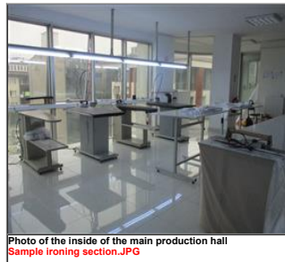
Photo of the inside of the main production hall Sample ironing section.JPG