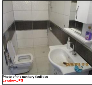
Photo of the sanitary facilities Lavatory.JPG