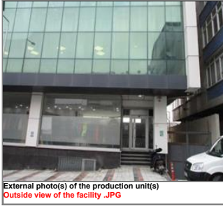
External photo(s) of the production unit(s) Outside view of the facility .JPG