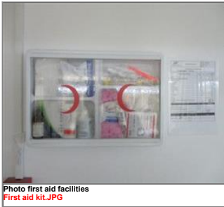
Photo first aid facilities First aid kit.JPG