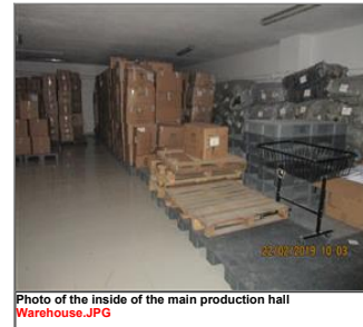
Photo of the inside of the main production hall Warehouse.JPG