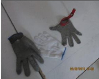
Photo of the personal protection equipments (if applicable) PPE.JPG