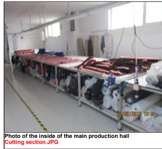
Photo of the inside of the main production hall Cutting section.JPG